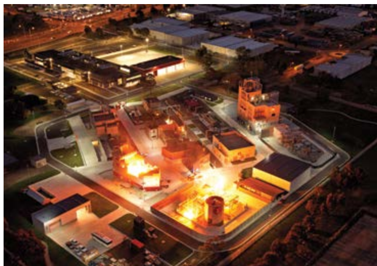
The Victorian Emergency Management Training Centre in action.

This project was the winner of the Australian Institute of Project Management (AIPM) 2014 Project of the Year and 2014 Construction / Engineering project over $100 million. It was also a GAA 2014 Sorel Award finalist.