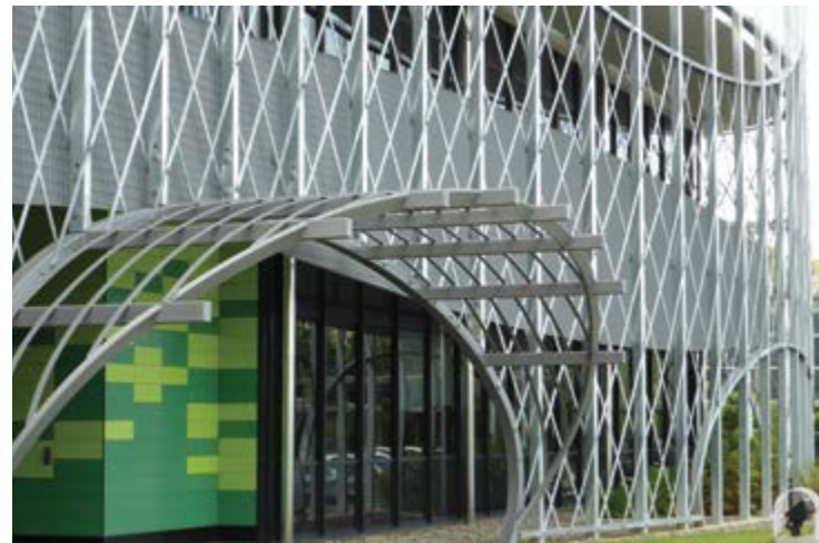
Here the hot dip galvanized trellis combines with a modern skin to complete the building entrance.

This project was awarded Commendations for Interior Architecture and Public Architecture in the 2014 Australian Institute of Architects, Queensland Chapter awards. It was also a GAA 2014 Sorel Award finalist.