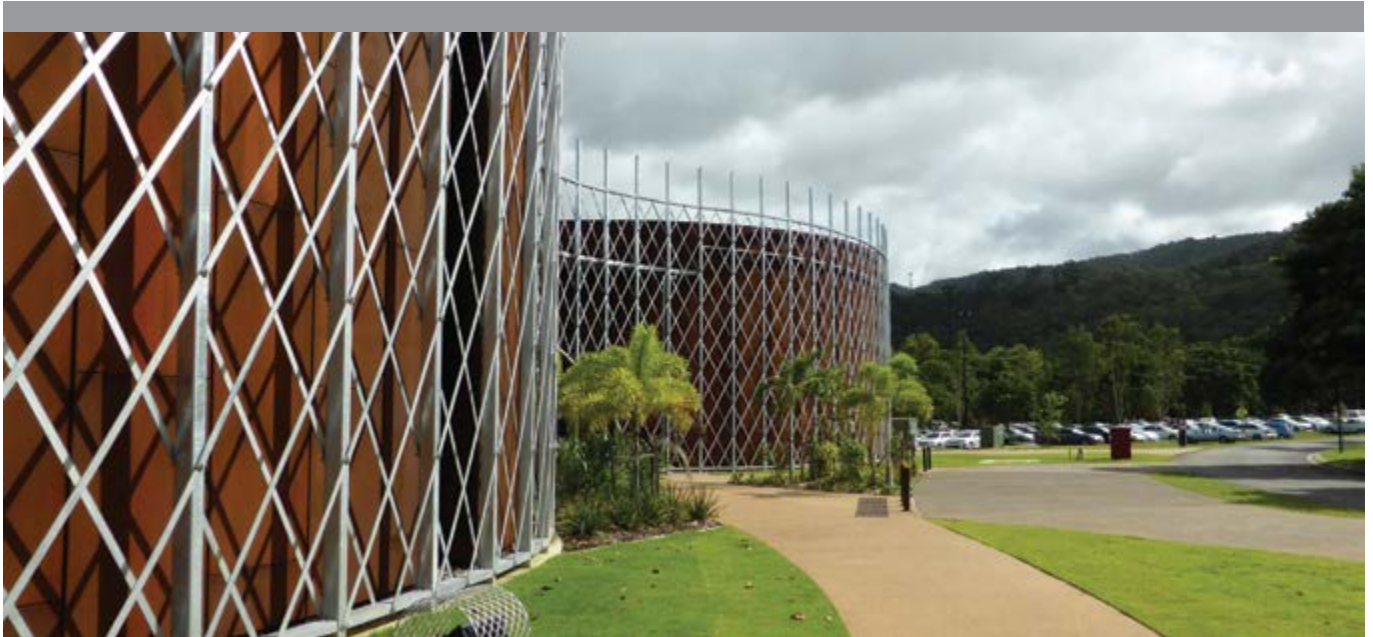
Hot dip galvanizing and weathering steel combine to provide a stunning contrast clearly visible from the nearby main road.

A university building in North Queensland proves once again that hot dip galvanized (HDG) surfaces can lift the appeal of prominent architectural features without additional treatments required.