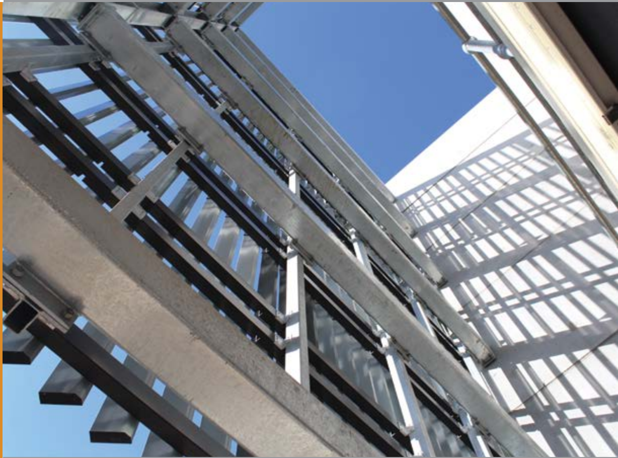
Austin Health – Walton Constructions

As such, it will serve as an essential aid for engineers, architects, specifiers and consultants for many years to come. AS/NZS 2312, Guide to the protection of structural steel against atmospheric corrosion by the use of protective coatings , originated in 1967 as a guide for steel designers on methods for the corrosion protection of structural steel. The previous revision (2002) incorporated much information on the common methods of corrosion protection, including paint, HDG, thermal spray, powder coating and wrapping systems.