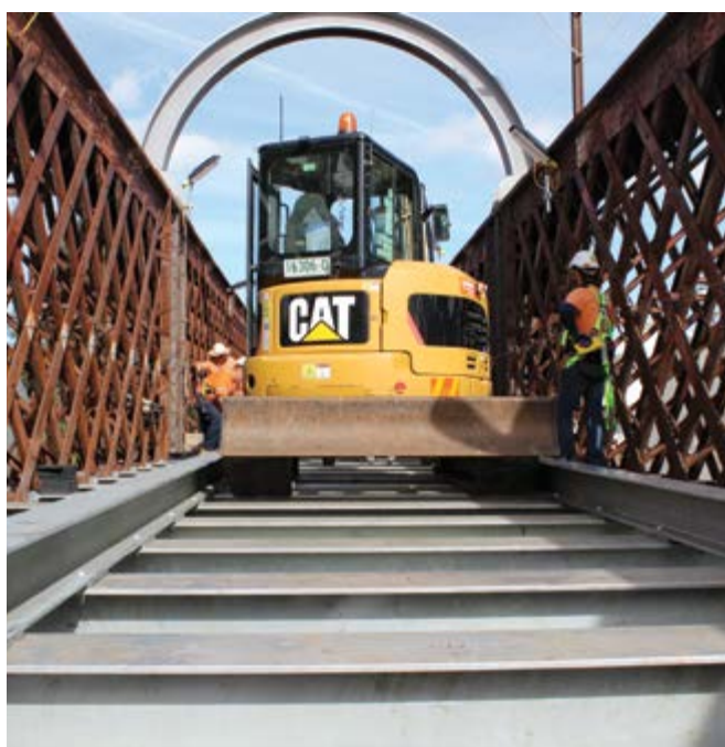
Galvanized stringers being secured to the newly-installed cross-braces.