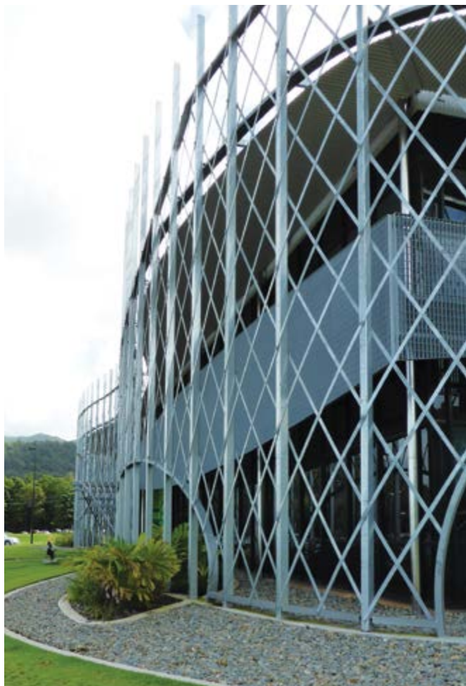
James Cook University

3 HDG coatings thicker than 85µm are not specified in AS/NZS 4680, however in conjunction with the galvanizer, a specification may be written for thicker coatings.