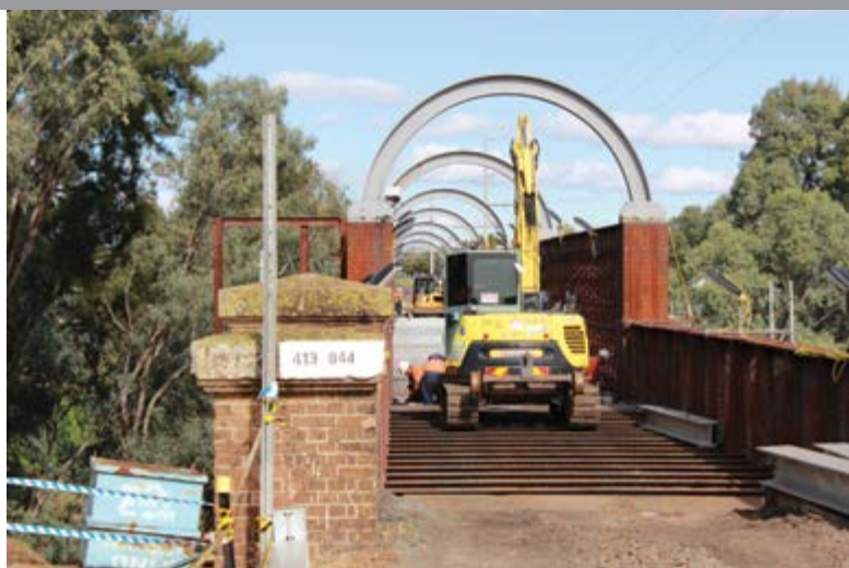
Installation of over 300 galvanized cross-braces required a round-the-clock effort to ensure this vital bridge link was returned to operation on schedule.

Hot Dip Galvanizer: Industrial Galvanizers