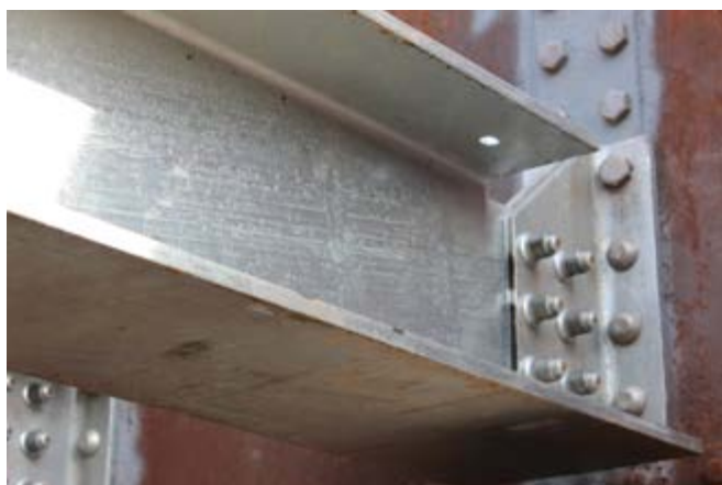
Riveted fasteners were replaced to facilitate speedy removal of the old cross-beams during the 16-day outage.